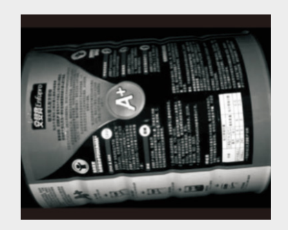
Food packaging can exterior inspection