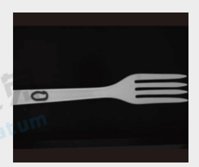
Metal fork inspection